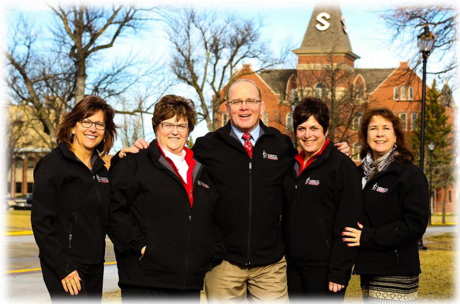
NDSCS Foundation Team