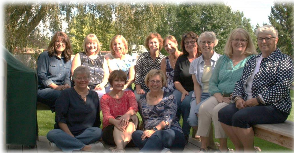
NDSSS Dental Hygiene Class of 1976