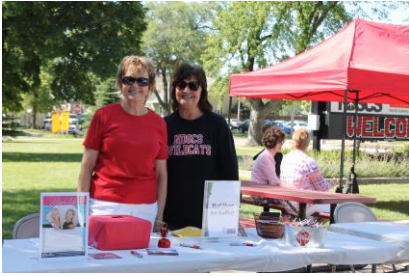
Red Door Art Gallery

Twenty-seven businesses from Wahpeton/Breckenridge and the surrounding communities participated in the 2016 Business Expo on the Wahpeton NDSCS campus, Monday, August 23, 2016. New and returning students had the opportunity to learn about service available to them in our community. Thanks to all the businesses and organizations that participated!